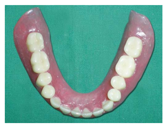
Fig. 9: Finished and polished flexible mandibular complete denture

the sprues (Fig. 8) and finishing. The first step is polishing with pumice or pumice substitute. Mix the pumice with water, place on prosthesis and polish with the help of buff. Second step is polishing with brown Tripoli which is also used for polishing of gold and acrylic. The Tripoli develops shine on the prosthesis and also little heat generated during polishing seals the surface to resist discoloration and staining. The prosthesis should dip in cool water while polishing with Tripoli to avoid warping or scalding of the surface. The Tripoli oil residue can be removed from the prosthesis with soft bristle denture brush. To maintain the shine of the prosthesis, it is important to clean the prosthesis daily after every meal.