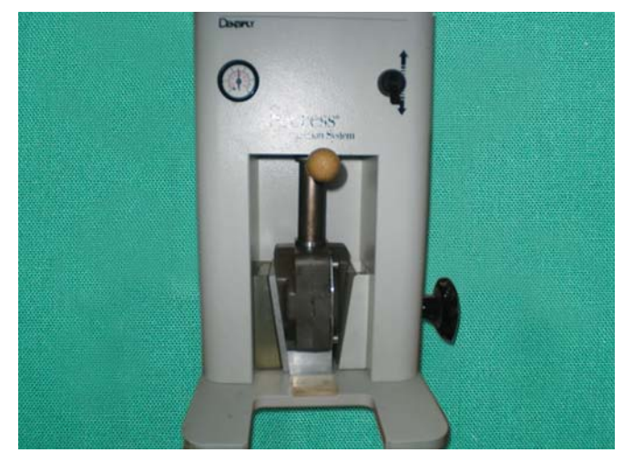
Fig. 5B: Pressure compression unit

material should be plasticized for 15 to 20 minutes at 550 to 560°F (Valplast). The softening temperature may be different for different types of flexible denture base material (follow manufacturer instructions). Maintain this temperature for 15 to 20 minutes. Remove the cartridge from the electric furnace and place it on the inlet of the flask and compress the mechanical compressor (Fig. 5A). The time between removing the cartridge assembly from the furnace and injection should be less than 1 minute. If longer, the cartridge will begin to cool and may result in partial or no injection. The levers of the press should be turned rapidly to apply firm pressure until the springs of the press were fully compressed.<sup>3</sup> The pressure should be maintained for 3 to 5 minutes. The pressure was then relieved and the flask was allowed to bench cool for at least 15 to 20 minutes before opening.<sup>3</sup> The material flows through the sprues into the mold. Open the flask and retrieve the prosthesis. The flasks should not be opened immediately to prevent distortion of the prosthesis.