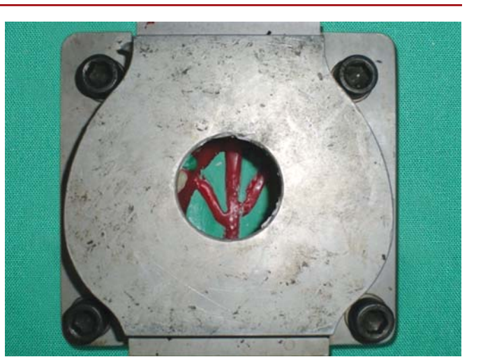
Fig. 3: Injection molding flask