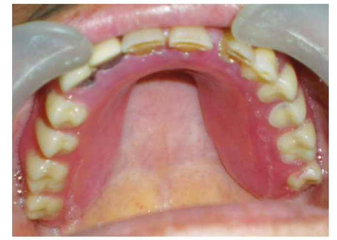
Fig. 7: Prosthesis in patient mouth

material should be plasticized for 15 to 20 minutes at 550 to 560°F (Valplast). The softening temperature may be different for different types of flexible denture base material (follow manufacturer instructions). Maintain this temperature for 15 to 20 minutes. Remove the cartridge from the electric furnace and place it on the inlet of the flask and compress the mechanical compressor (Fig. 5A). The time between removing the cartridge assembly from the furnace and injection should be less than 1 minute. If longer, the cartridge will begin to cool and may result in partial or no injection. The levers of the press should be turned rapidly to apply firm pressure until the springs of the press were fully compressed.<sup>3</sup> The pressure should be maintained for 3 to 5 minutes. The pressure was then relieved and the flask was allowed to bench cool for at least 15 to 20 minutes before opening.<sup>3</sup> The material flows through the sprues into the mold. Open the flask and retrieve the prosthesis. The flasks should not be opened immediately to prevent distortion of the prosthesis.