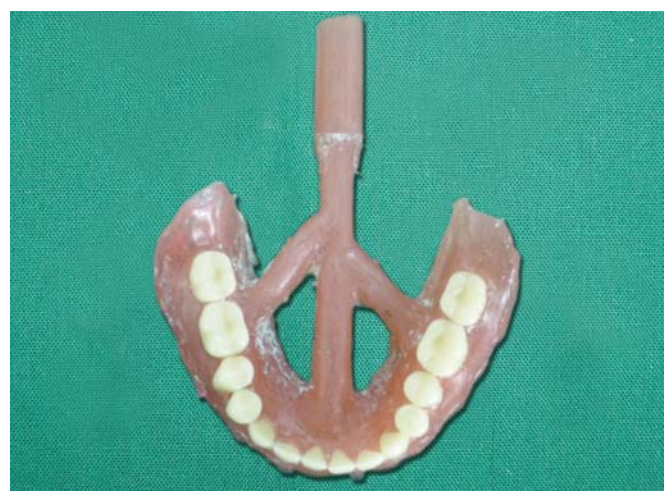
Fig. 8: Mandibular complete flexible denture with sprue former