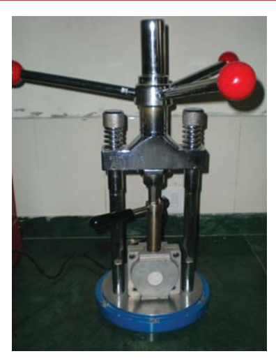
Fig. 5A: Manual compression unit

Injection Molding Technique for Fabrication of Flexible Prosthesis from Flexible Thermoplastic Denture base Materials