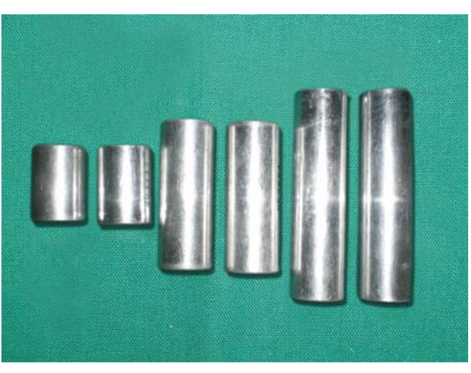
Fig. 1: Cartridges containing granules of flexible denture base material

Flexible denture base materials are thermoplastic material which becomes fluid when heated in an electrical cartridge furnace to a specific temperature. These are available in the form of granules in cartridges of different sizes (Fig. 1). Small size cartridges are used for fabrication of small size flexible partial dentures and large size cartridges are used