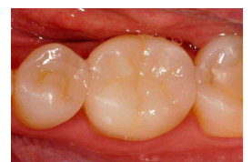
Silver fillings replaced by porcelain inlays/onlays